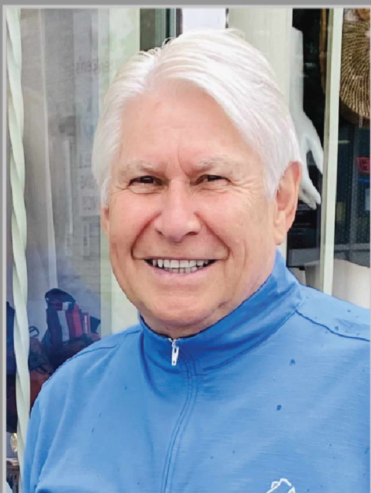
Ken Boshcoff Community Foundation