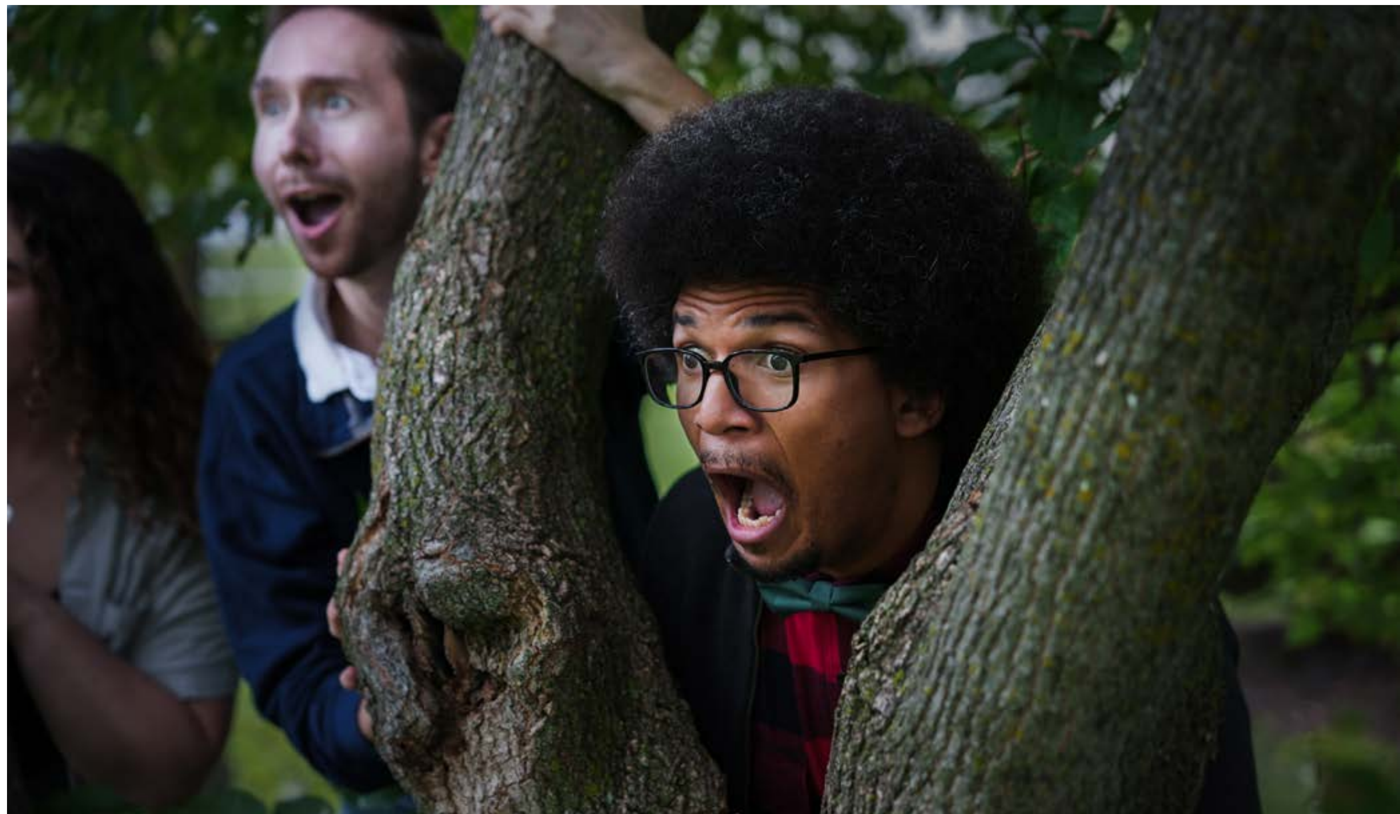
The Cast of BIGFOOT! . Photo by Tommy FM / Sociable Solutions